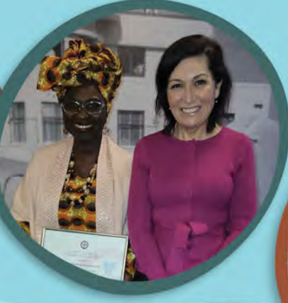
July 2022: Open Hands Community Care – QLD Day 2022 Award Recipient