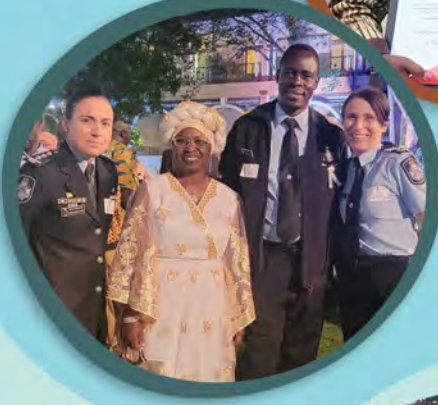
October 2022: Queensland Parliament African Reception